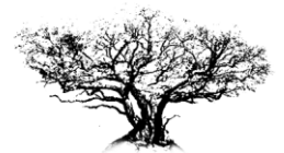
Fig Tree – A small fruit tree (Ficus Carica) with large leaves, known from the remotest antiquity. It was probably native from Syria westward to the Canary Islands.

Fettuccine 35 House Made Fettuccine with Peas, Squash, Zucchini, Portobello Mushrooms and Roasted Bell Peppers in Roasted Garlic Cream Sauce with Basil Pesto